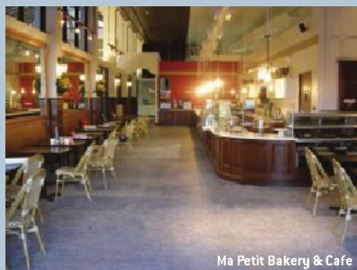
Ma Petit Bakery & Cafe